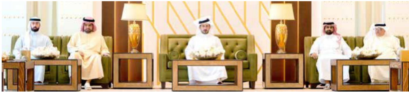
HH Shaikh Khalid bin Hamad Al Khalifa alongside other officials at the reception

● Kingdom's recent winners on global, continental, Arab and Gulf stages honoured in ceremony