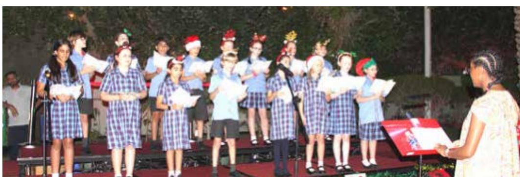
Children sing Christmas carols

The Christmas Carols Party combined the joyous spirit of National Day with a Christmas