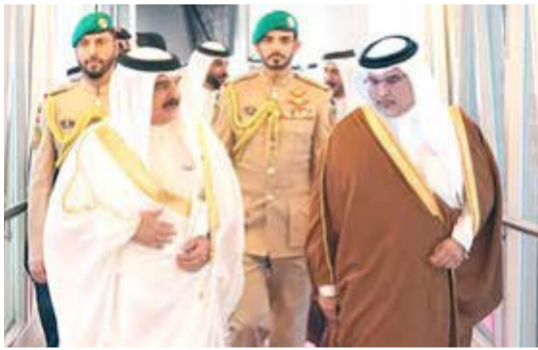
HM the King is welcomed by His Royal Highness Prince Salman bin Hamad Al Khalifa, the Crown Prince and Prime Minister, upon his return from the summit