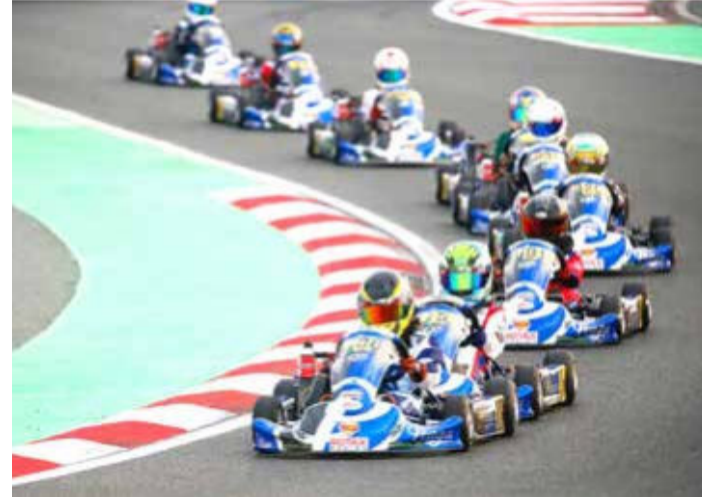
Karters in action at BIKC

over the world who are battling wheel-to-wheel along BIKC's 1.414-kilometre CIK-FIA track.