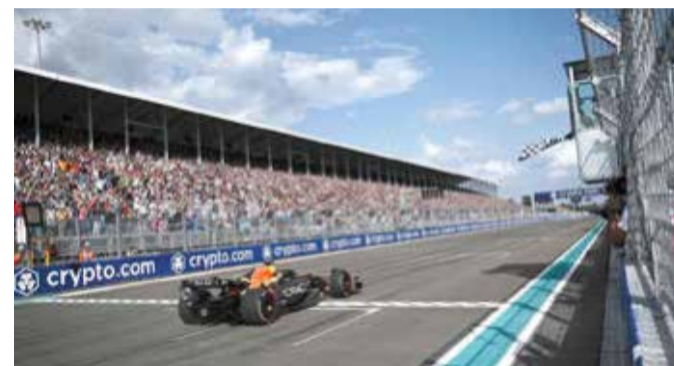
Red Bull's Sergio Perez leads teammate Max Verstappen during the 2023 Miami Formula One Grand Prix (file photo)

The United States, Austrian, Brazilian and Qatari Grands Prix will again host sprints, which offer eight championship points to the winner.