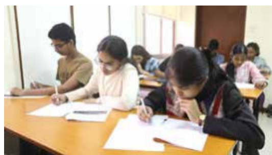
CBSE students taking the examination

The examination, held on 1st December 2023 at the FIITJEE Adliya Centre, saw an overwhelming response, prompting