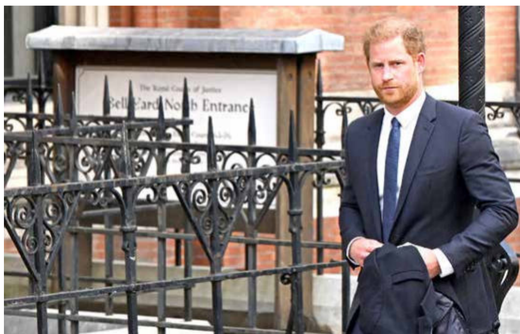
Britain's Prince Harry, Duke of Sussex leaves from the Royal Courts of Justice, Britain's High Court, in central London

The Duke of Sussex, as he is formally known, had been told he would no longer be given the "same degree" of personal protective security that he previously