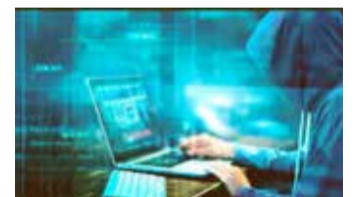
Chief of the Electronic Crimes Prosecution.

The incident came to light following a report from the Economic Crimes Directorate at the General Directorate of Anti-Corruption, Economic, and Electronic Security.