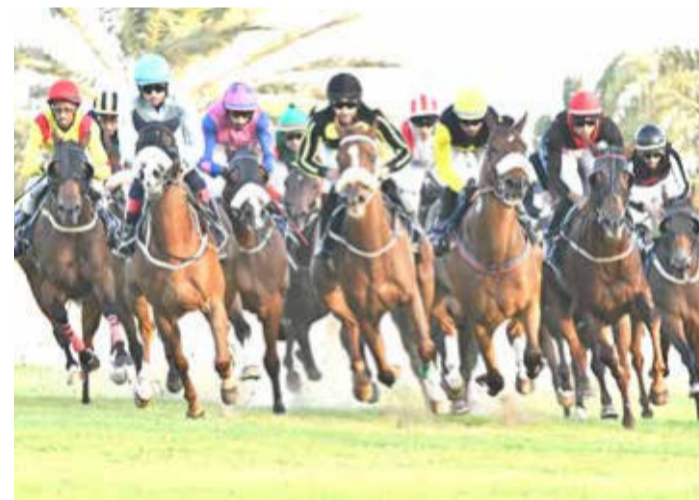
Races at REHC in past weeks