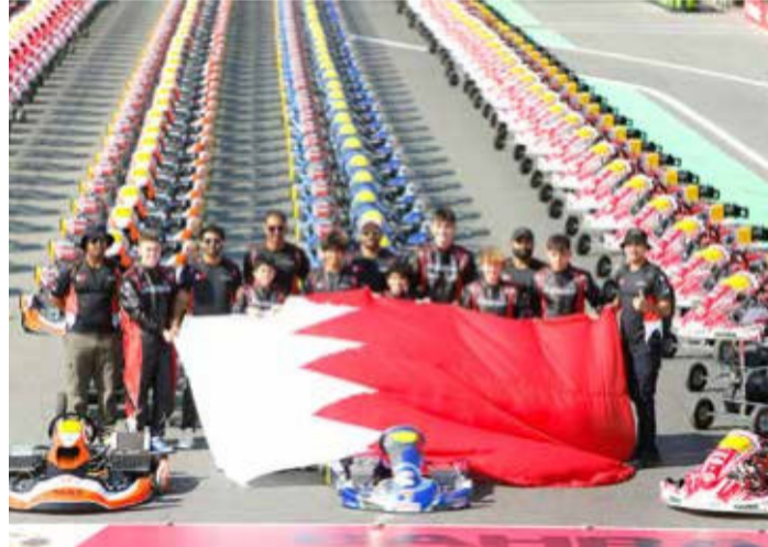
Team Bahrain karters and officials

Team Bahrain have a nine-strong contingent amongst the nearly 400 karters from all