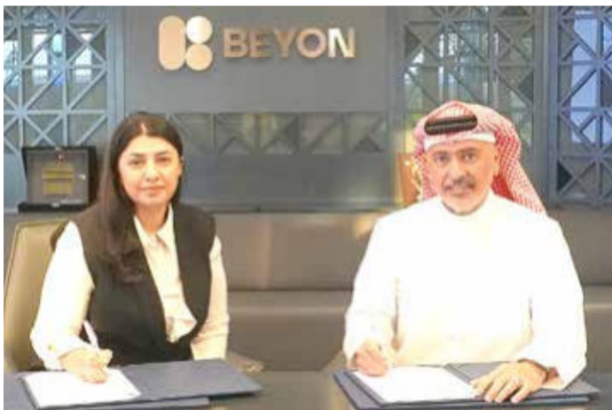
Soudal Quick-Step's French rider Julian Alaphilippe (C) cycles during the 14th stage of the 110th edition of the Tour de France (file photo)

The IRONMAN 70.3 Middle East Championship Bahrain,