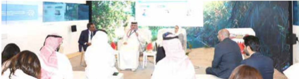
In pictures, the participants at the event

Bourse, said, "We strongly applaud the steps undertaken by the CBB for introduction of a standardized regulatory framework for ESG reporting, which will bring greater consistency and comparability to ESG disclosures within the market particularly on climate change, as this forms a key milestone towards achieving a net-zero economy. This milestone will facilitate further growth within the wider sustainability ecosystem in capital markets through promoting green finance initiatives and green indices products".