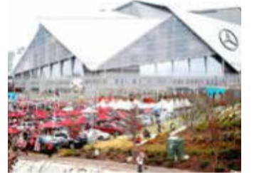
Outside view of the Mercedes-Benz Stadium before a match (file photo)

Semi-finals will be played at MetLife Stadium in New Jersey and at Bank of America