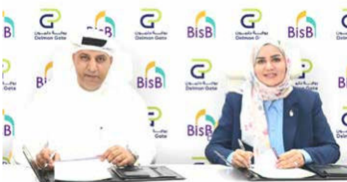
The deal signing

Additionally, customers will enjoy a financing grace period of up to 3 months from the implementation date until the first