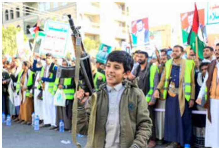
A Yemeni youth lifts a gun during a march in solidarity with the people of Gaza in the Huthi-controlled capital Sanaa

The poorest country in the Arabian peninsula has faced one