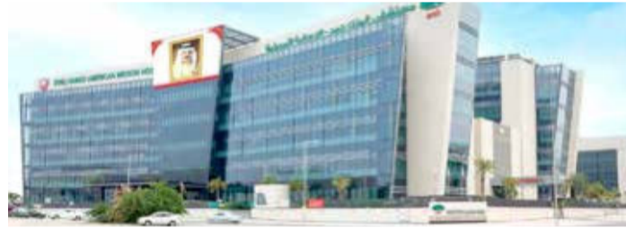
King Hamad American Mission Hospital