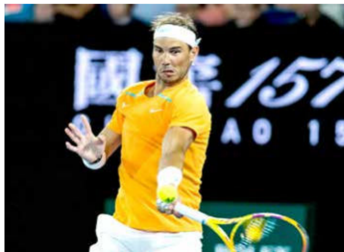
Rafael Nadal in action (file photo)

"To have the ability not to demand myself what I have demanded myself throughout my