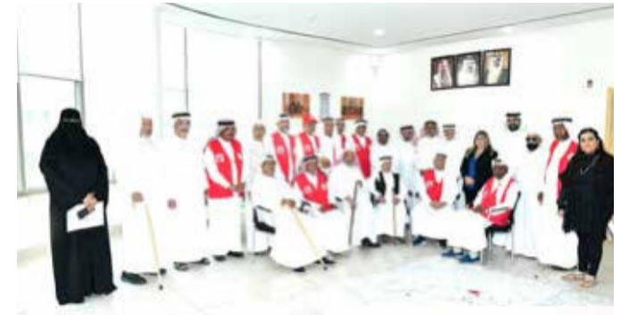
Participants during a photocall