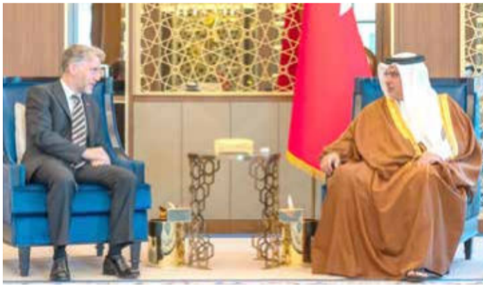
HRH Prince Salman with UK Ambassador Long

HRH the Crown Prince and Prime Minister hailed the UK's role, alongside allied countries, in consolidating international security and peace, which supports development and pros-