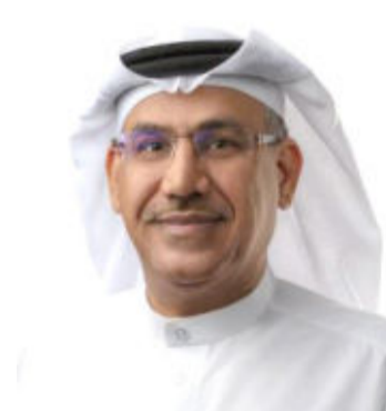
MP Ahmed Qarata