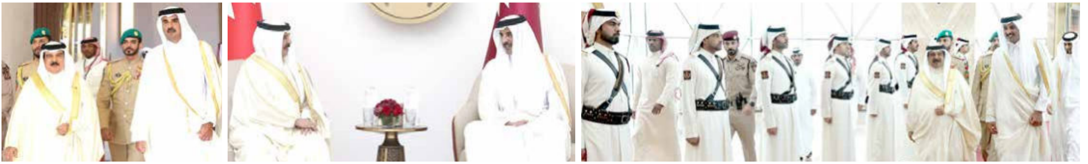
His Majesty King Hamad bin Isa Al Khalifa arrived yesterday in Doha, at the invitation of the Amir of the State of Qatar, His Highness Shaikh Tamim bin Hamad Al Thani, to participate in the 44th Summit of the Supreme Council of the Gulf Cooperation Council (GCC). HM the King was received in Doha International Airport by HH Shaikh Tamim bin Hamad. The session was inaugurated by HH Shaikh Tamim bin Hamad.