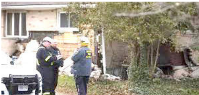
A suspect inside the building at the time of the blast had fired a flare gun

"As officers were attempting to execute the search warrant,