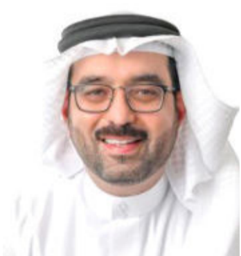
MP Ahmed Al Saloom