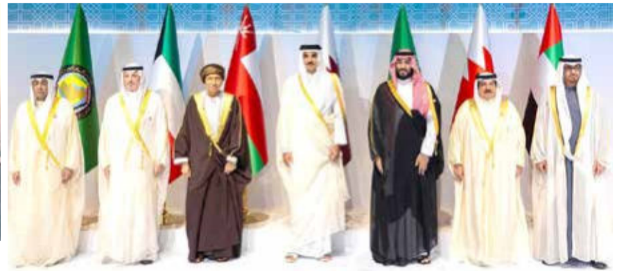
HM King Hamad with GCC leaders

Majesties and Highnesses, leaders of the GCC countries, on the occasion of Qatar's hosting of the summit.