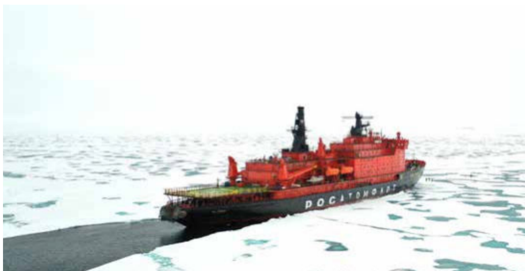
The Russian "50 Years of Victory" nuclear-powered icebreaker is seen at the North Pole

Moscow hopes the development of a northern sea route, made possible by global warming and the consequent melting of glaciers, will enable it to redirect its hydrocarbons -- now under Western sanctions -- to Asia. "The RITM-200 reactor is the newest reactor which